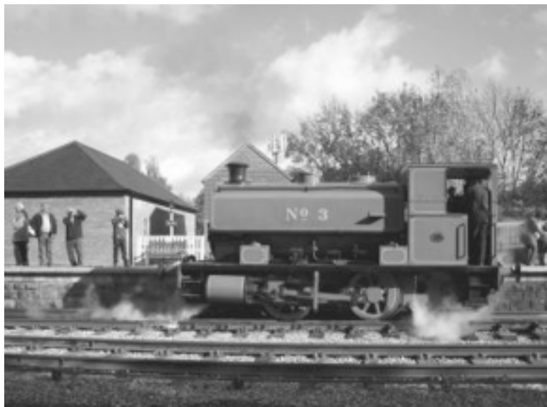
No. 3 arrives at Duffield

The reconstruction has been a costly business: £1 ¾ million pounds has been spent on restoring the line. Funding has come from the 1,200 shareholders, from private contributions, from the East Midlands Development Agency, from using the line to